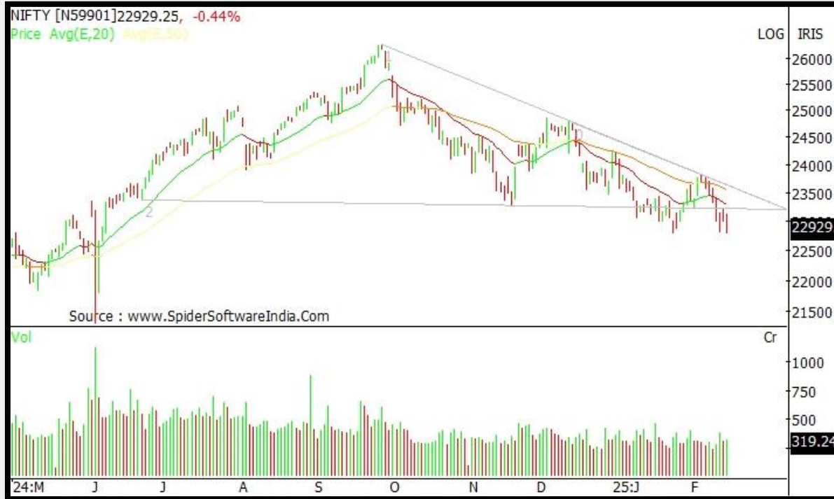
Daily Chart (22,929.25)